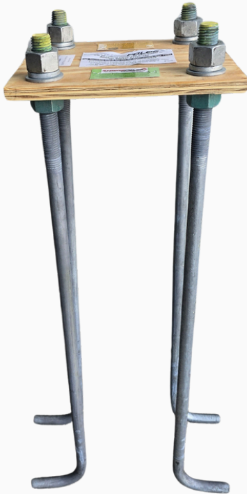
"C" (1") Bolt Diameter

NOTE: Please do not use a twin nut leveling system, (commonly found on light poles). Our Poles must be fastened directly to the concrete. Then before the concrete is cured, Remove the template and make sure foundation is level and smooth to mount the pole