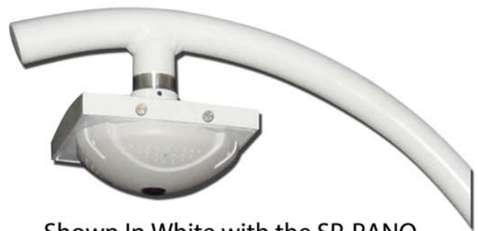
Shown In White with the SP-PANO Panoramic Dome Camera Mount.

Comes with Pole Mounting Hardware and gasket